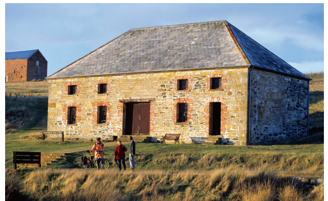
The historic Commissariat Store erected late in 1825 to hold stores for the early convict station.