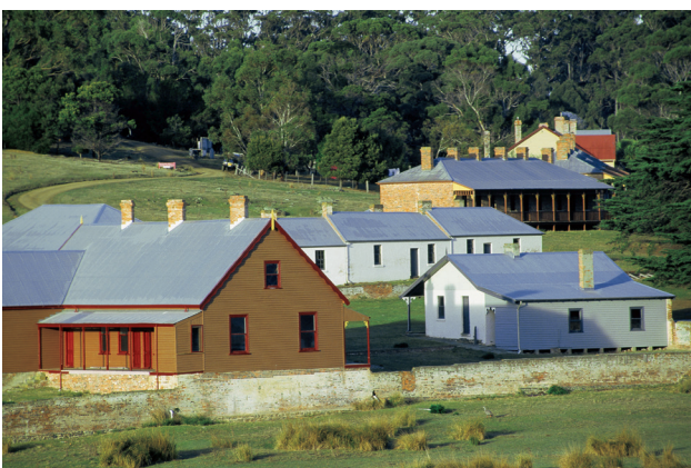
Darlington