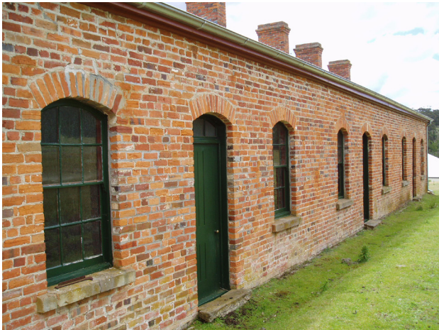
Bernacchi Terrace houses - rear