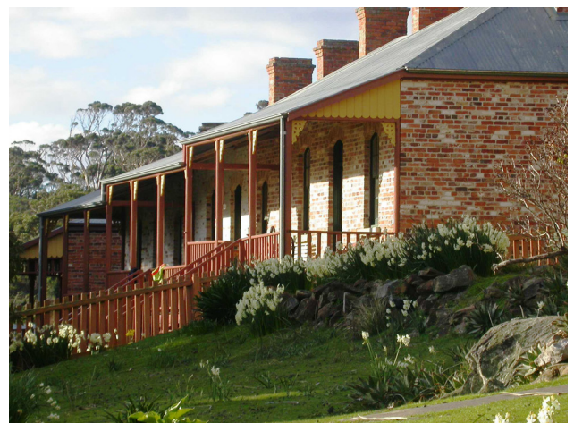
Bernacchi Terrace houses - front

Maria Island National Park Office: Phone (03) 6257 1420.