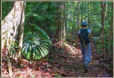
Hiking the Blue Arrow