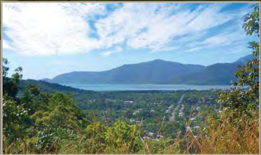
View from the Green Arrow