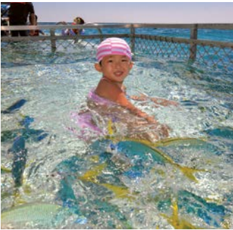
KIDS OCEAN POOL