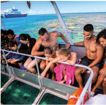
GLASS BOTTOM BOAT