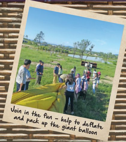
Join in the fun - help to deflate and pack up the giant balloon