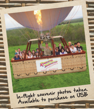
In-flight souvenir photos taken. Available to purchase on USB