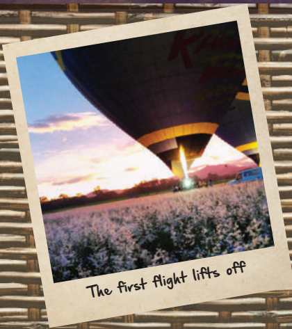
The first flight lifts off

Post first flight, EXPRESS guests return directly to Cairns. CLASSIC guests may fly on the first or second flight. Post second flight, all guests will join in the fun of helping to pack up the giant balloons before celebrating with a glass of sparkling wine and a light breakfast.