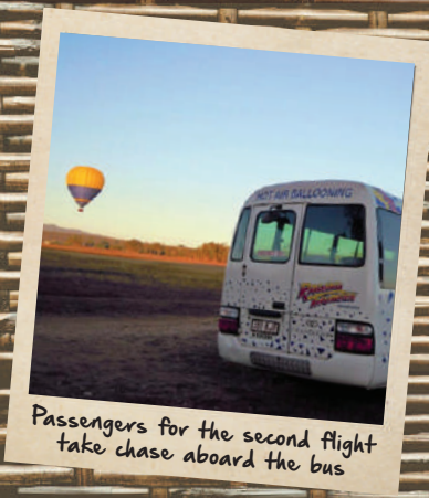
Passengers for the second flight take chase aboard the bus