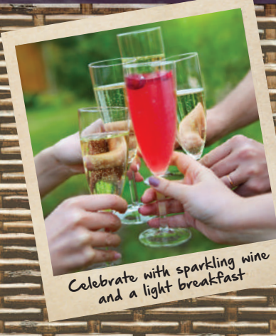
Celebrate with sparkling wine and a light breakfast