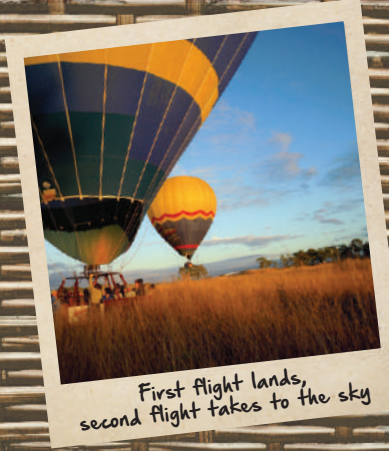
First flight lands, second flight takes to the sky