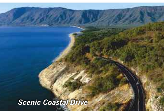
Scenic Coastal Drive

PLEASE NOTE: Tours subject to weather conditions. Alternative to Bloomfield track route may be taken - no refund given.