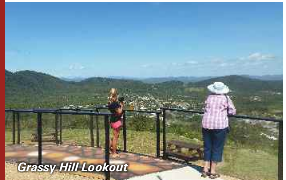
Grassy Hill Lookout