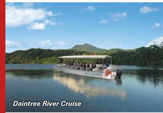
Daintree River Cruise