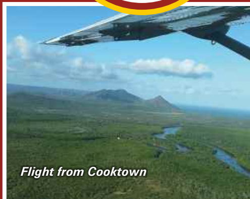
Flight from Cooktown