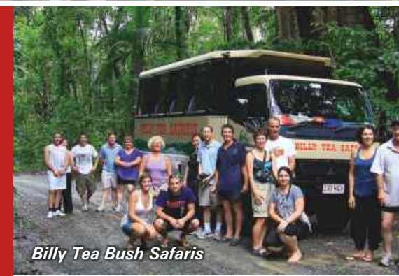
Billy Tea Bush Safaris