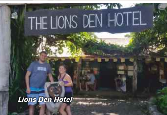
Lions Den Hotel