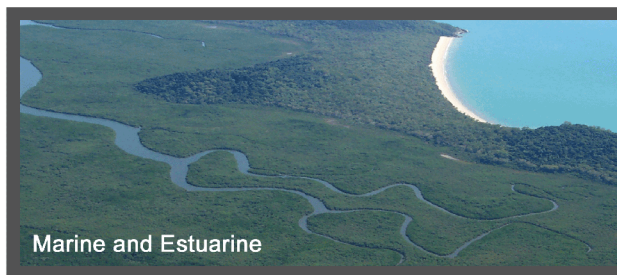
Marine and Estuarine